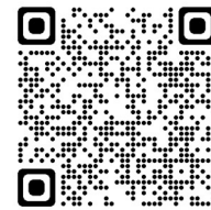
Visit the website!